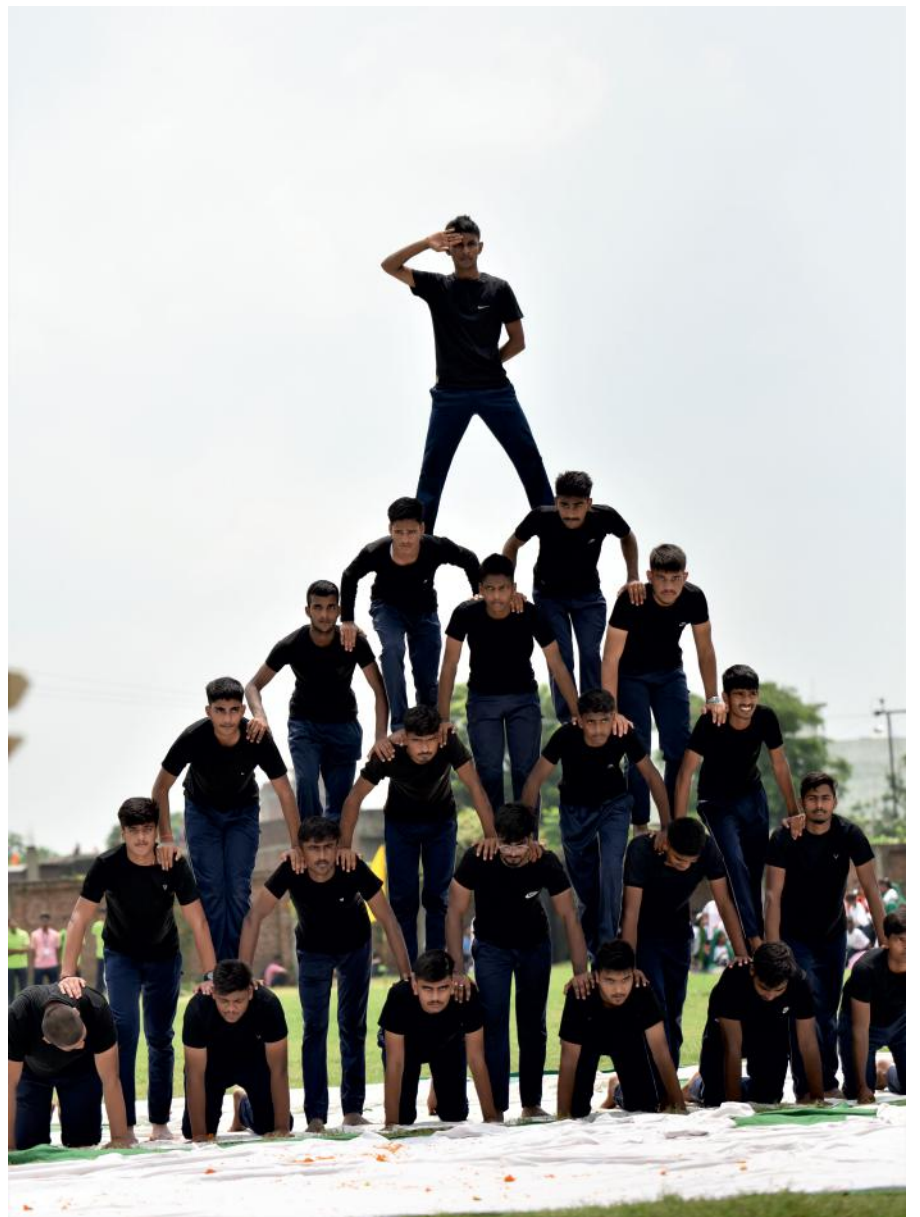
A Tapestry of Folk Dances Honoring India's Independence